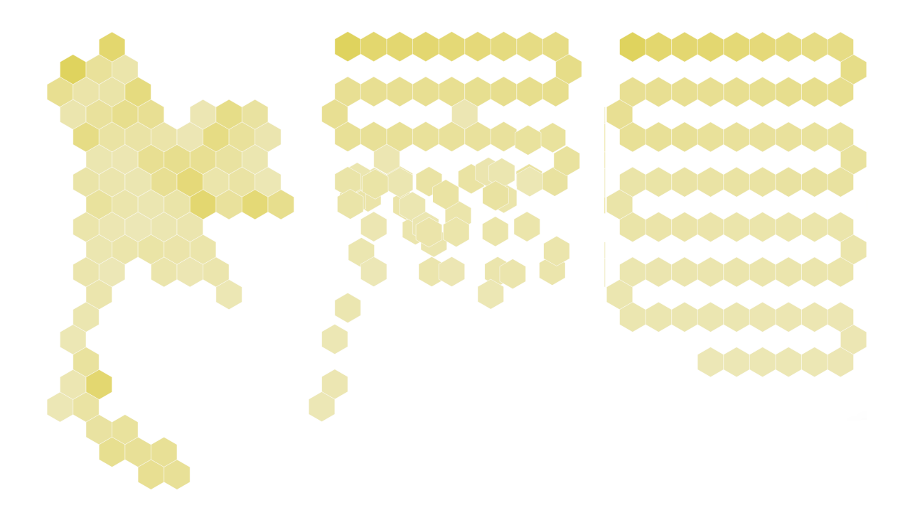
Figure 3: The source, an in-between, and the target of the transition from a hexagonal grid map of Thailand in TPMAP to a hexagon list sorted by the data values. Each hexagon's position is linearly interpolated between the source and target positions with cascaded delays.

connected scatterplot also addressed a comment that the visualizations are not attractive enough. The animations excited some users and invited them to interact. To the users, animated hexagons in a grid map and lines in a connected scatterplot felt more concrete. They were helpful to construct a frame to familiarize themselves with what they do not know (Lee et al., 2016).